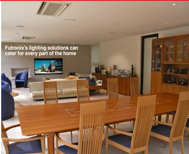
Futronix's lighting solutions can cater for every part of the home